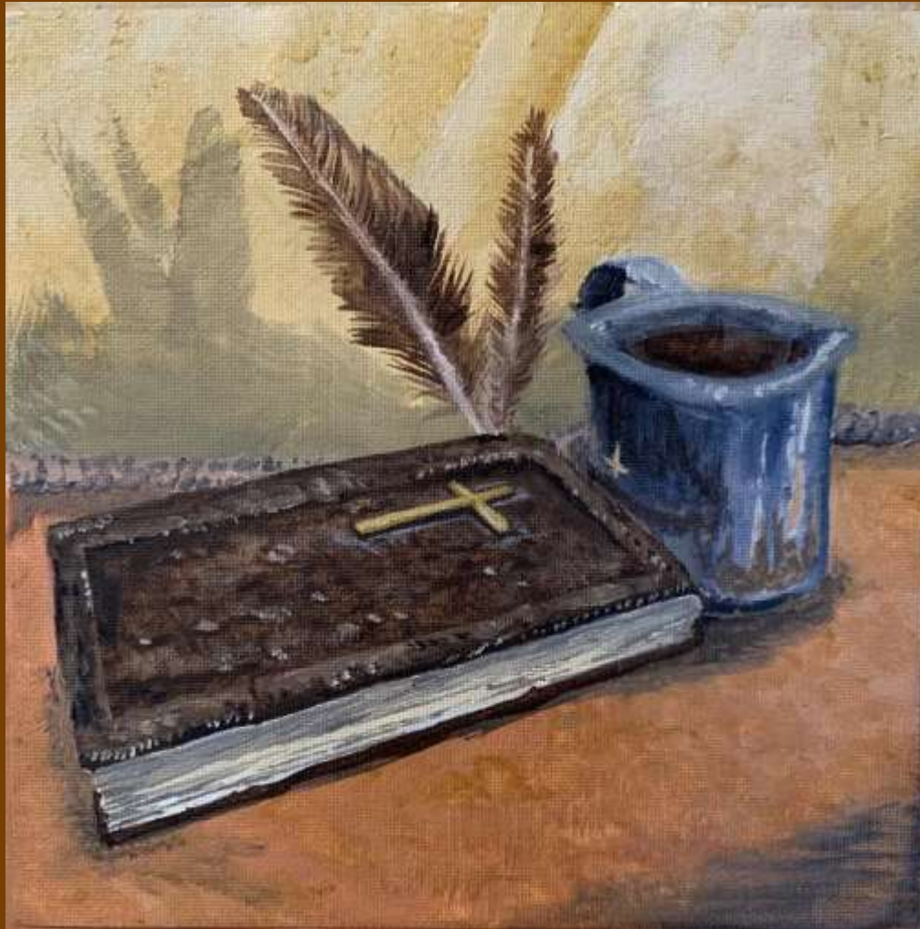
8" x 8" Oil on canvas $100

-Historically, religion was a large part of any cowboy's life. When these men explored the range surrounded by perils and the uncertainty of tomorrow, religion was one thing they turned to for guidance and security.