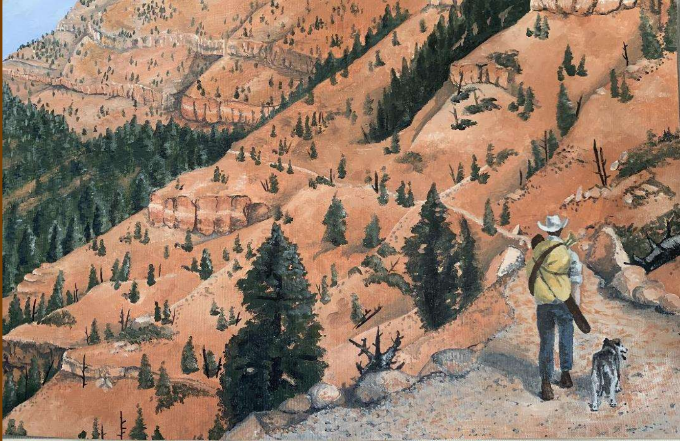
22" x 14" Oil on canvas $150