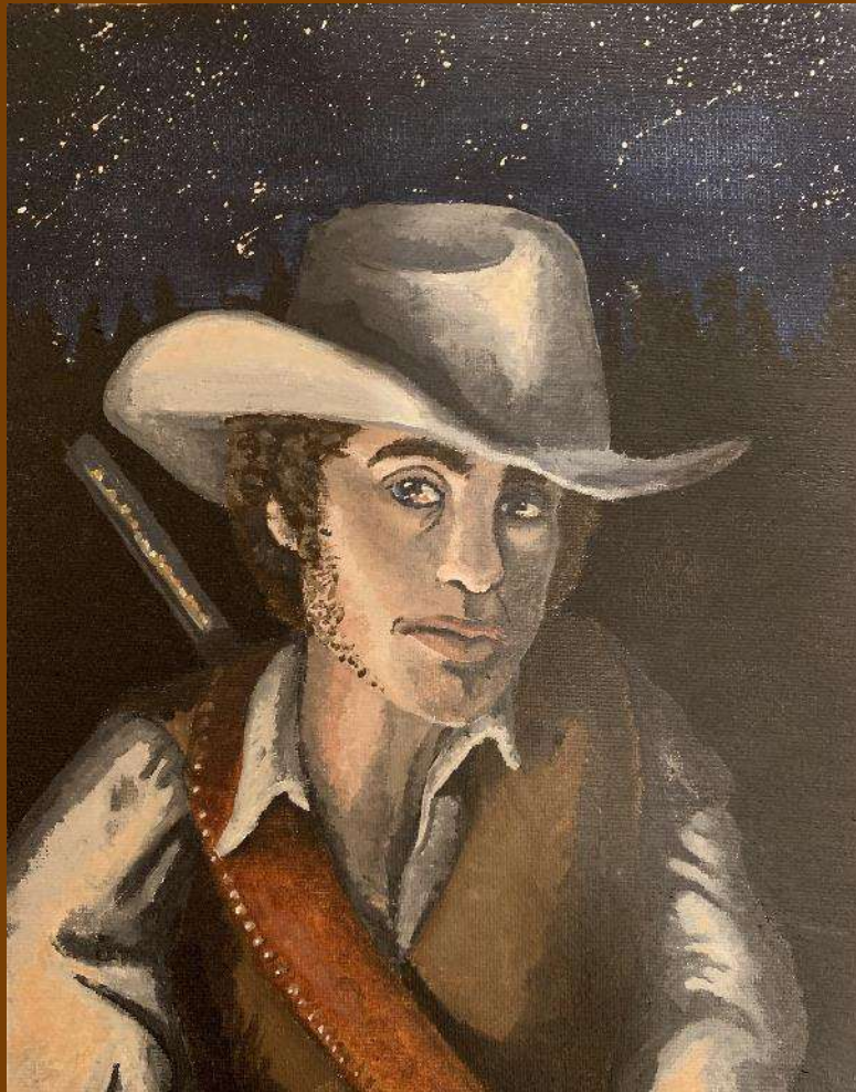
9" x 12" Oil on canvas NFS

-This piece had a rocky start. I wanted to create a portrait of this cowboy to give him a bit of character to notice throughout the concentration. With a few failed attempts at a human face, I decided to use a picture of myself for both a better reference and a way to better control the lighting.