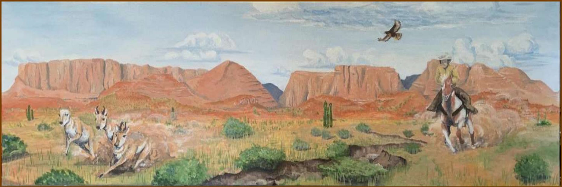
36" x 12" Oil on canvas NFS

-I really wanted to signify the vast open land of the range with this piece. In some parts of the west, it would take travellers weeks just to cross one valley. Also with this piece, I decided to experiment with movement, while still having a noticeable landscape.