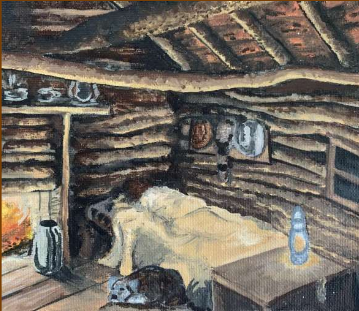
7" x 6" Oil on canvas $100

-Every now and then, cowboys, miners, and mountain men had places to call a home, especially during the colder, harsher months of the year.