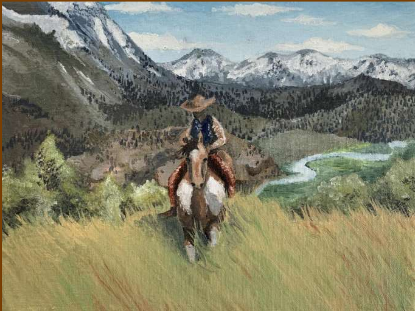
9" x 12" Oil on canvas $80

-Although this piece was smaller than many of the others, I explored how far I could stretch the landscape and invest in a new environment.